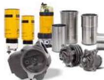
Alternative spare parts for Caterpillar