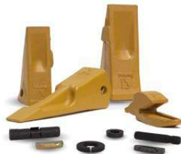
High Wear Items