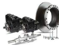
Spare parts suitable for Volvo