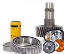
Spare parts suitable for Case